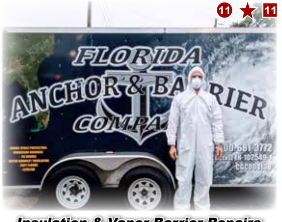
Insulation & Vapor Barrier Repairs Soft Floor Repairs & Laminate Flooring

Wishing you good health and safety, The Florida Anchor & Barrier Team